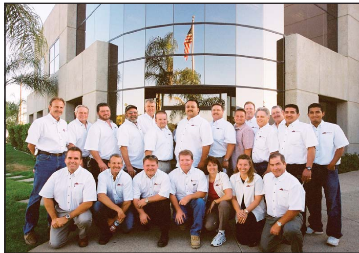
Above: the Red Mountain Machinery Team, hosts for the evening;